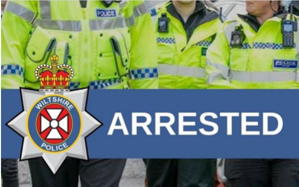
Sunday afternoon patrols in Devizes.

Alternatively, call Crimestoppers anonymously on 0800 555 111.